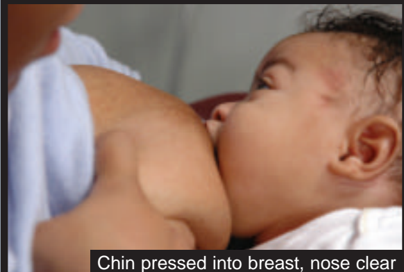
Chin pressed into breast, nose clear