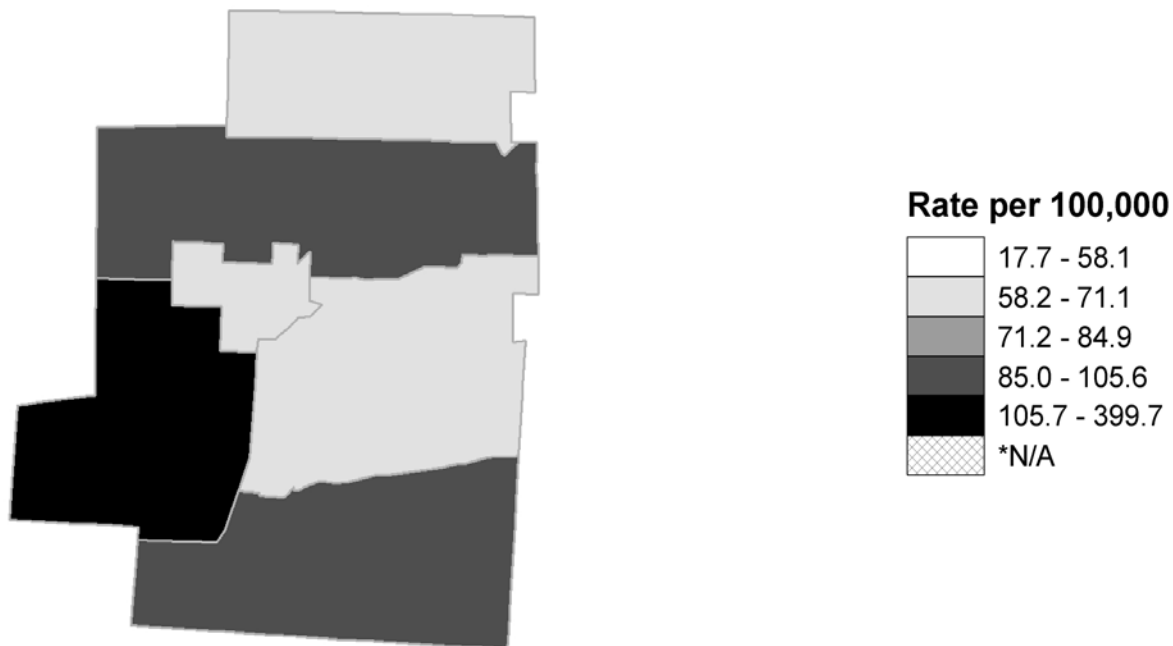
Figure 2. Average Annual Age-adjusted Incidence Rates of Invasive Colon and Rectum Cancer, by Census Tract, in Morrow County, 1996-2005 1-4